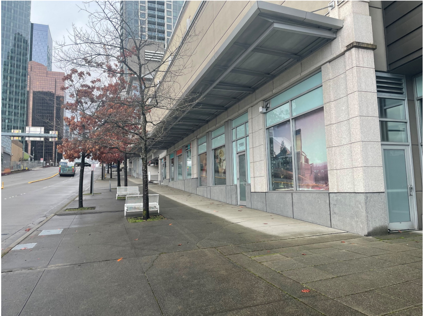
Streetscape from Corner of Building from East to West