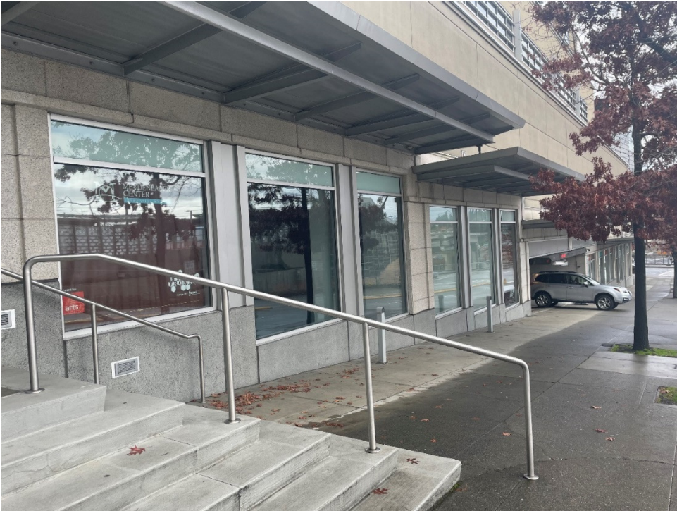
Windows West of the Garage Entrance from West to East