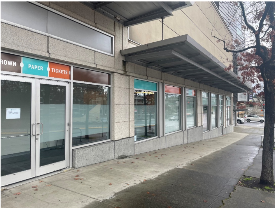
Windows East of the Garage Entrance from West to East